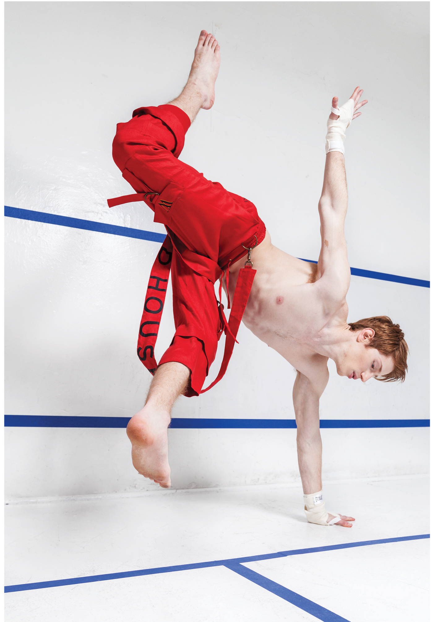
pants, WOOD HOUSE