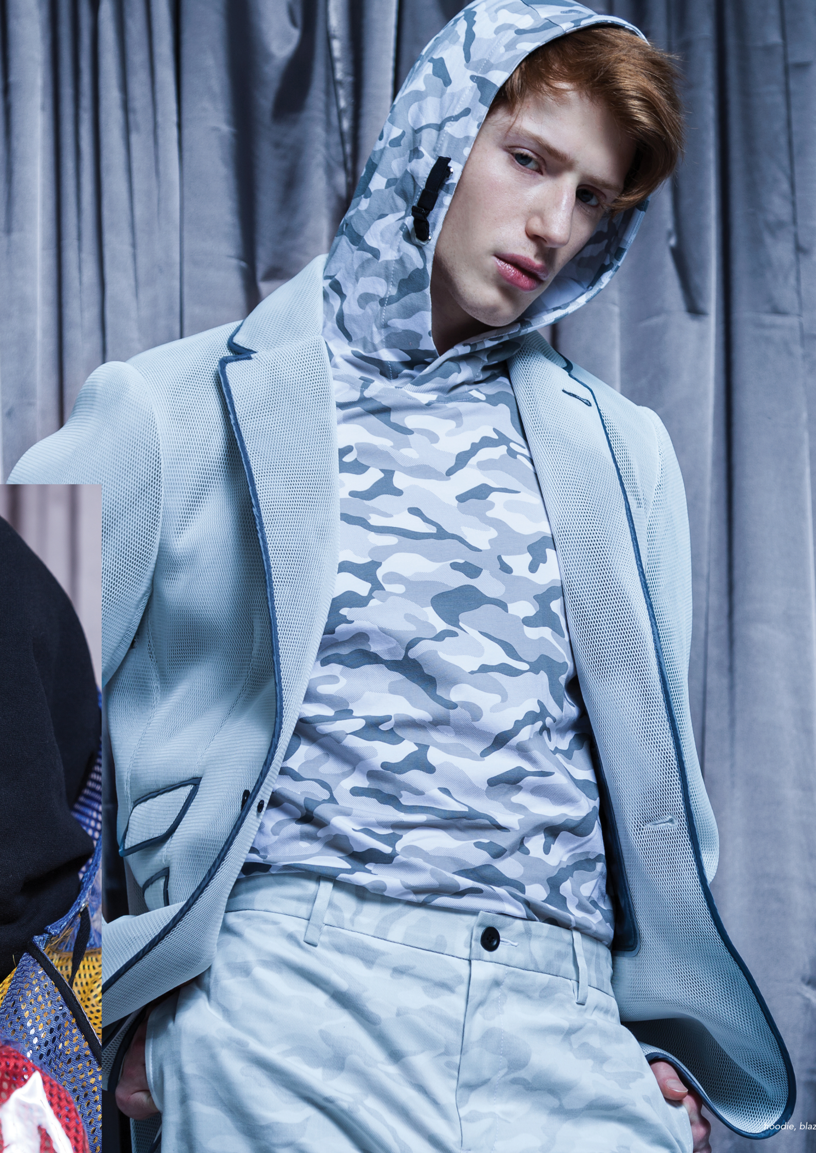
hoodie and plastic coat, WOOD HOUSE sneakers, DSQUARED2