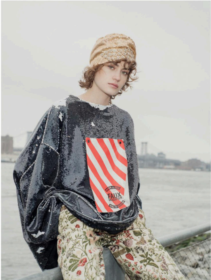
Maison le Faux shirt, Astier floral pants ,Laurel Dewitt gold turban